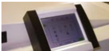
User-friendly control panel The logical touch panel allows easy and user-friendly monitoring of status, alarms and settings.