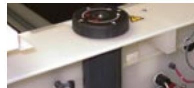
Easy access to filter The top operated developer filter housing allows the filter to be easily removed, eliminating the need for emptying the tank prior to filter removal.

Possibility of connection directly to modem for remote monitoring and control.