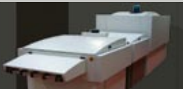
Quartz Supreme plate line The Quartz Supreme plate processor shown in a plate-line

The Quartz Supreme plate processor has been developed in close co-operation with the leading thermal plate manufacturers.