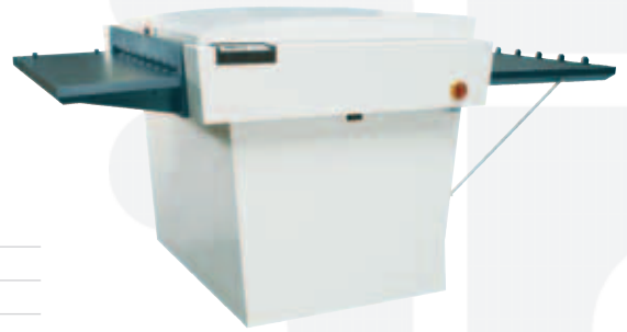
Shown with additional options